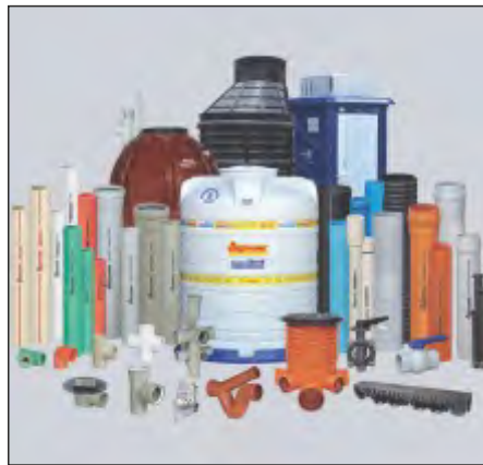
Plastic Pipe Systems

brings convenience, accessibility, affordability, and most importantly, adds value to everyday life.