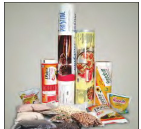
Performance Packaging Films

customer centricity. They aim to provide products and services which improve the quality of life and exceed customer expectations. Supreme's large portfolio is a testament of its painstaking efforts towards research and development. Every product is designed keeping in mind the customer needs and its overall impact in improving the quality of life.