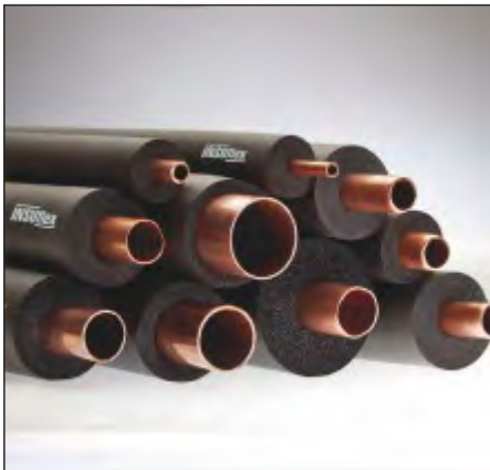
Protective Packaging Products

Founded in 1942, Supreme Industries has been relevant with changing times and continues to be a household name