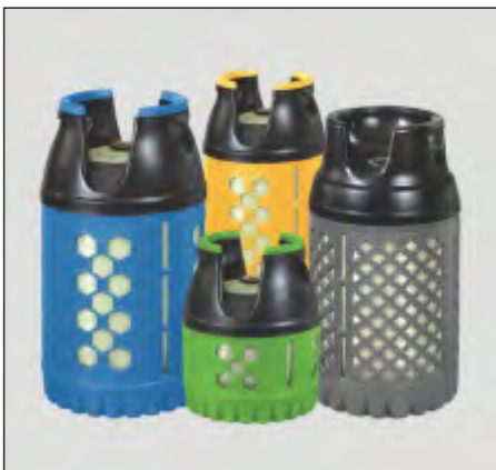
Composite LPG Cylinders

Films and Composite LPG Cylinders. Every Supreme product is not just made to be consumed but is designed to create an impact. The diverse product portfolio