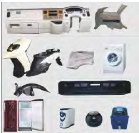
Industrial Moulded Products

Furniture, Industrial Moulded Products, Performance Films, Material Handling Products, Protective Packaging Products, Multi-layer Cross Laminated