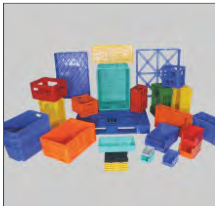
Material Handling Products

solely because of the core values that it upholds. Powered by a robust infrastructure and expertise, Supreme is one of India's largest plastic manufacturing