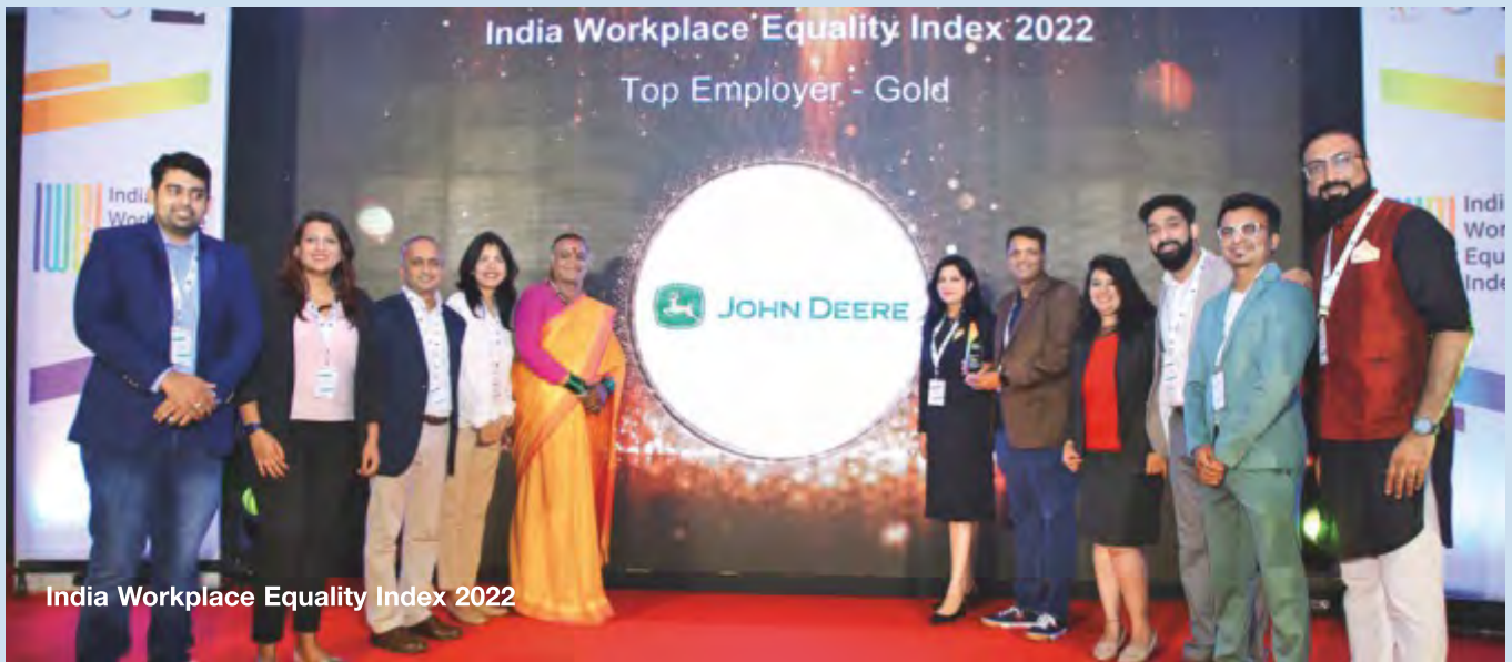
India Workplace Equality Index 2022