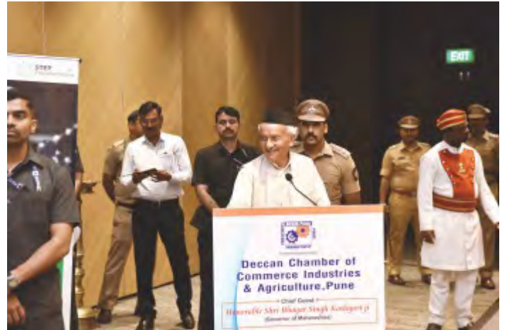
Bhagat Singh Koshiyari, Governor of Maharashtra addressing the audience

“When we were hit by the second wave of COVID, DCCIA with support from Rotary Club Pune Downtown (RCPD), we provided free Oxygen Concentrators to the needy. The Chamber was the first to vaccinate over 20,000 workers in this Industrial