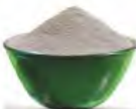
ATOMIZED IRON POWDER