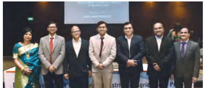
Sub committee members of the chamber