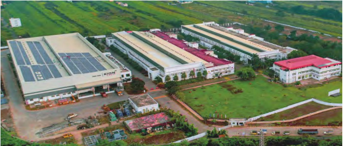
KION India Factory 2.0 : One of India's largest and most modern material handling equipment manufacturing facility

The global trend in the MHE (Material handling equipment) industry is pacing toward increased efficiency, enhanced productivity, maximized safety, and minimized downtime. With companies working several shifts to ensure efficient warehousing and the material supply to different industry segments, the requirement for entry-level MHE, electric pallet trucks, electric stackers, and electric forklifts have shown a drastic increase in the last 5 years. KION Group is one of the world