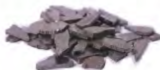
ELECTROLYTIC IRON FLAKES