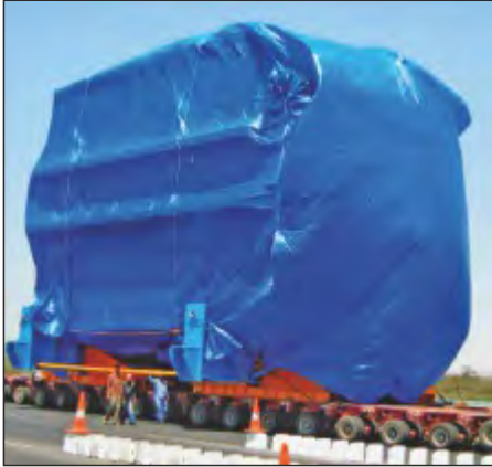
Multilayer Cross Laminated Films

An acknowledged leader of the Indian plastics industry, The Supreme Industries Ltd. offers the most diversified portfolio of plastic products. Supreme's large portfolio includes Plastic Pipe Systems, Water Tanks, Bath Fittings, Solvents, Moulded