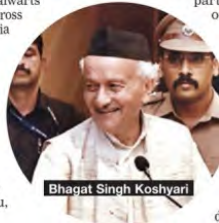
Bhagat Singh Koshiyari