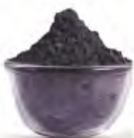
ELECTROLYTIC IRON POWDER

Incredible AM Private Limited (3D Incredible) is a subsidiary of IMP, established in 2017 to cater to the field of Metal 3D printing. It's touted to be India's largest 3D medical company manufacturing patient-specific implants, models, cutting guides, and jigs. It has completed upwards of 1500 surgeries, has a network of more than 30 distributors, and has worked with about 500 surgeons across India. Manufactured with the