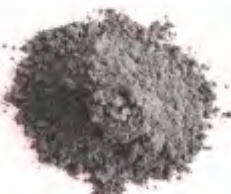
REDUCED IRON POWDER