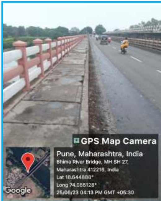
At Koregaon Bhima Bridge after cleaning