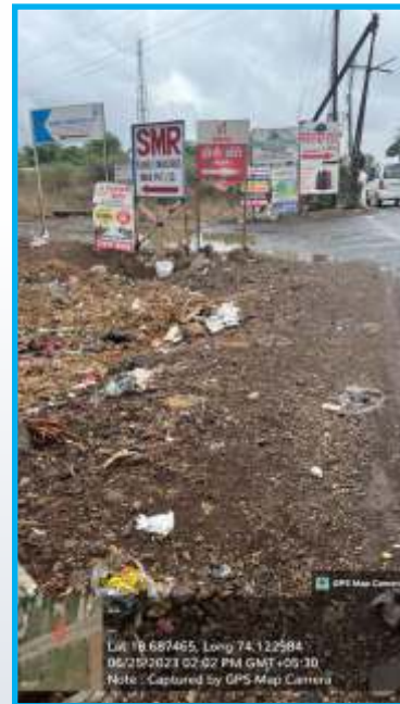
At Shikrapur after cleaning